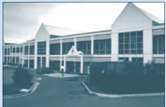
Knox Private Hospital - Melbourne, Australia

Contact HealthStaff Recruitment for more information on working at Knox Private Hospital.